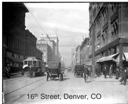
16 th Street, Denver, CO